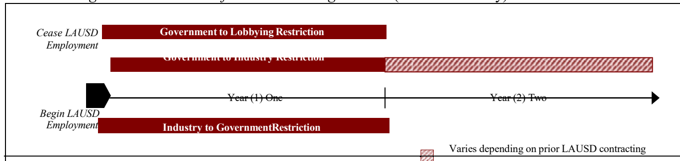
Figure 2 – Schematic of LAUSD Cooling Periods (Illustrative Only)