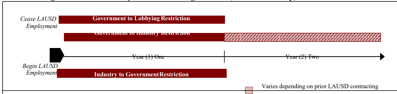
Figure 2 – Schematic of LAUSD Cooling Periods (Illustrative Only)