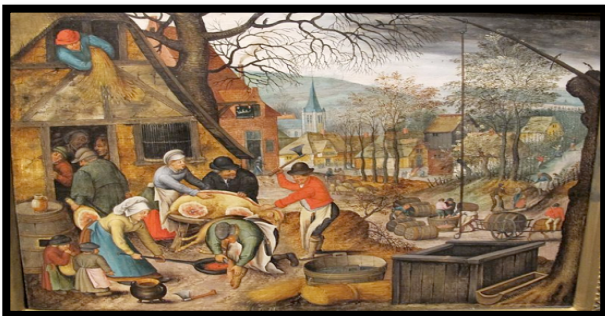
Visual Text for Teacher Modeling & Non-Modeling

NOTE: We would greatly appreciate your feedback in vetting these lessons through the following link: