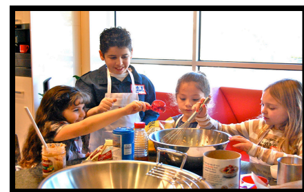
Conversation Norms Visual Text (Appendix B)

NOTE: We would greatly appreciate your feedback in vetting these lessons through the following link: