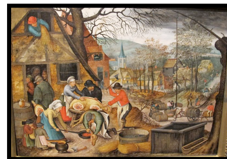
Model and Non-Model Visual Text Peasants Slaughtering a Pig by Pieter Brueghel (Appendix E)

Teacher: In the text, I see a man throwing hay out the window.