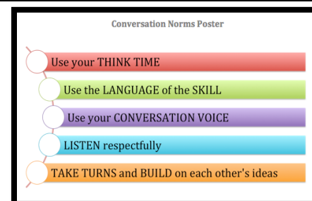
Conversation Norms Poster (Appendix A)