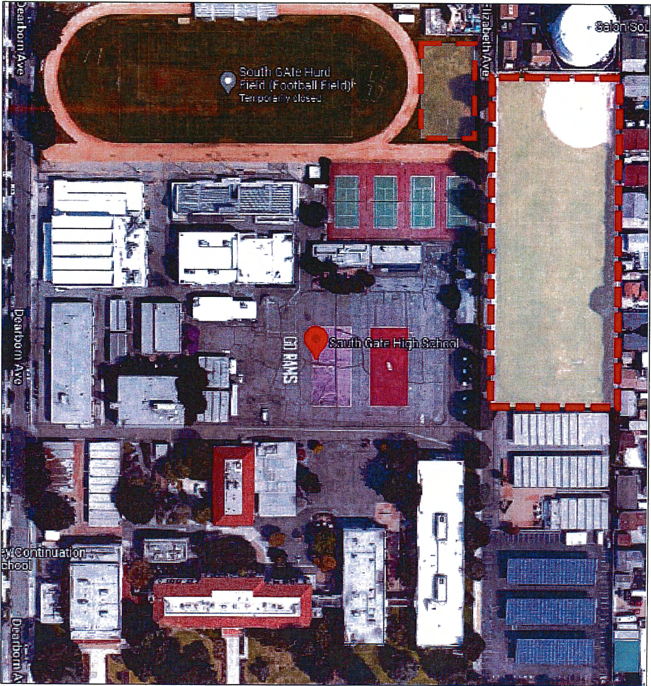
EXHIBIT A – CAMPUS SITE PLAN (not to scale)