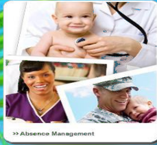
>> Absence Management