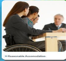
>> Reasonable Accommodation