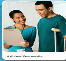
>> Workers' Compensation