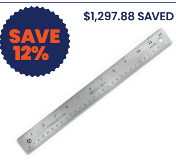
Ruler, Steel, 12" Cork Base (12 each/Box)