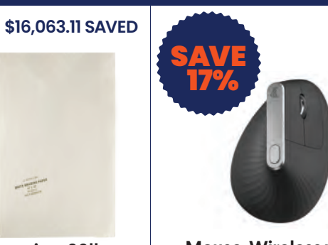
Mouse, Wireless vertical Regular