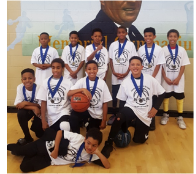
Champions of the Richmond/Oakland PAL Holiday Basketball Tournament.