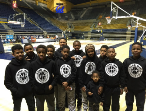
PAL participants tour UC Berkeley before the basketball tournament.