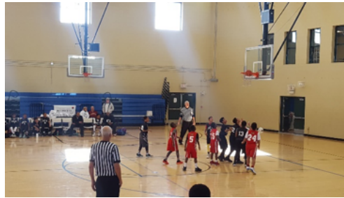
PAL participant in basketball tournament at UC Berkeley.