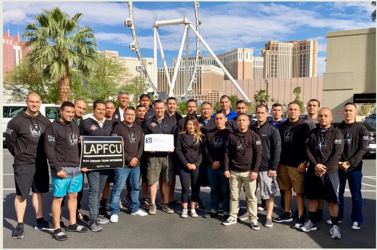
LASPD 2017 Baker 2 Vegas Team

The course begins 25 miles north of Baker CA, on Highway 127 to Shoshone CA; then northeast on Highway 178, across the stateline into Nevada on Highway 372 to Pahrump, then southeast on Highway 160 to the finish inside the Westgate Hotel Convention Room in Las Vegas. Teams are scheduled to run in 11 flights, depending on their ability, with flights starting hourly from 9 a.m. to 4