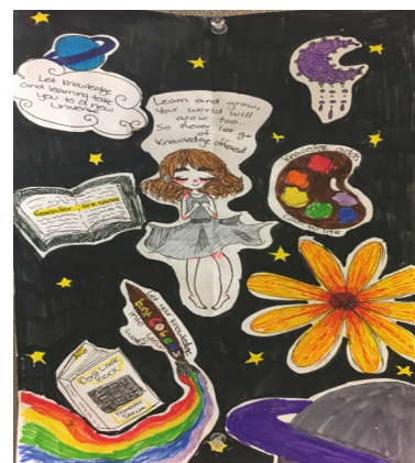
Studio Middle School