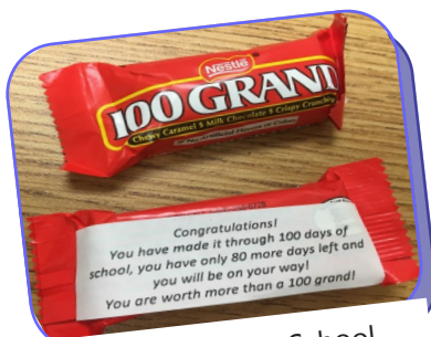
Liechty Middle School