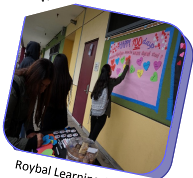
Roybal Learning Center