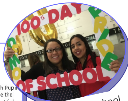
Jefferson High School

City Year partners with Pupil Services to celebrate the 100 th day at Jefferson High School and Clinton MS