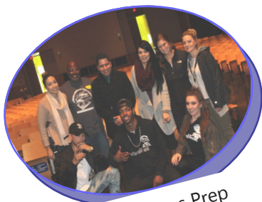
West Adams Prep

LDC schools celebrated the 100 th day of school to promote student attendance.