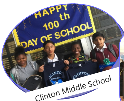
Clinton Middle School

RFK NOW celebrated the 100 th day with "conchitas" for students.