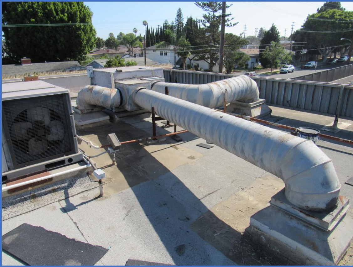
BB-1 Building – Existing Rooftop HVAC Unit