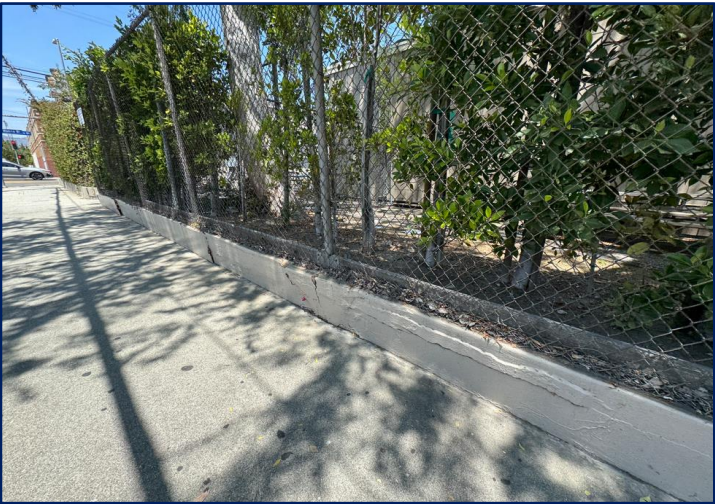
Fence leaning towards sidewalk and wall cracking on Van Ness Ave.