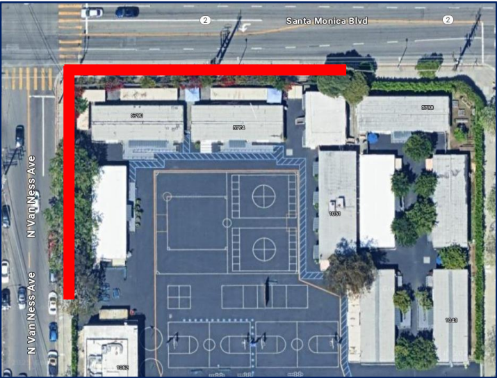
Area of work