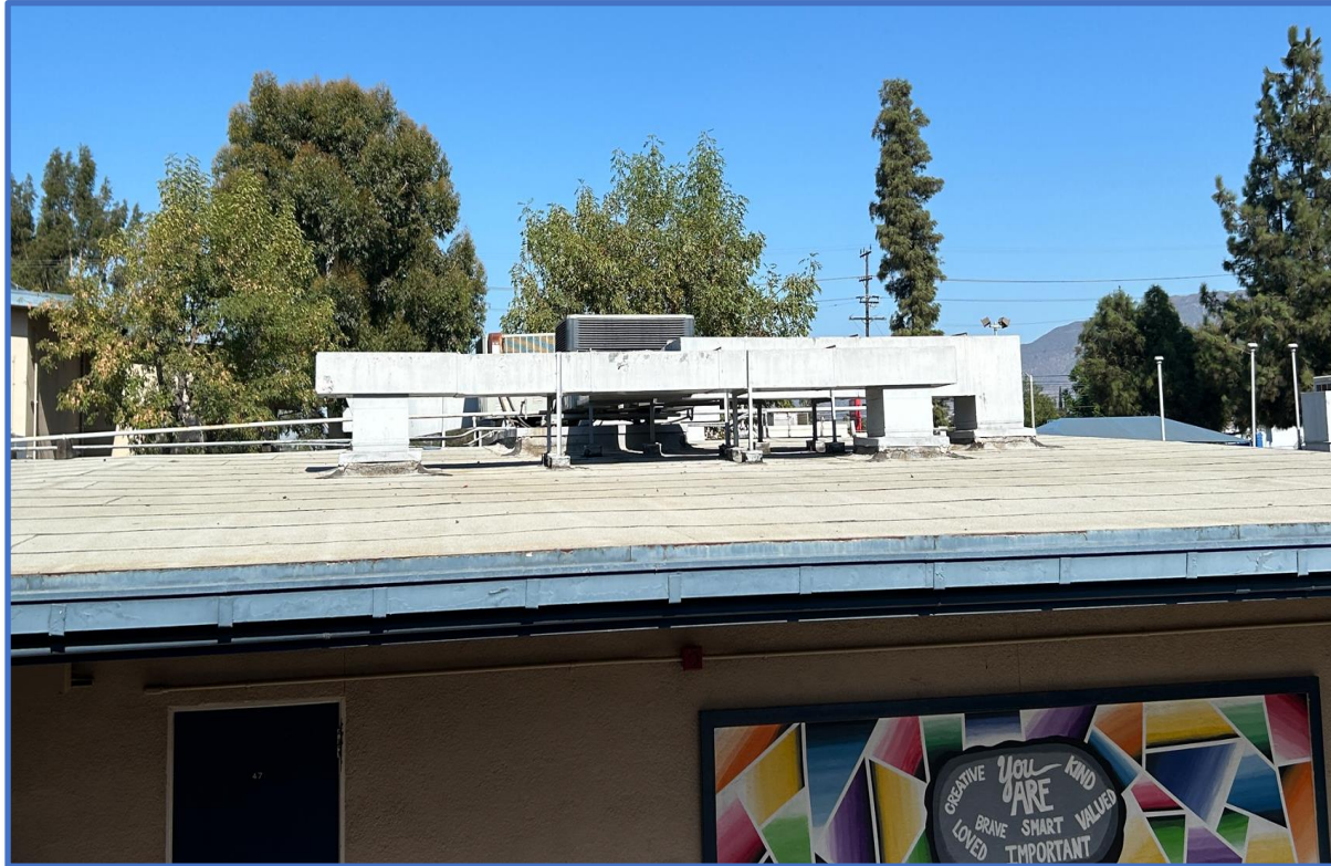
Building "E" Rooftop Unit