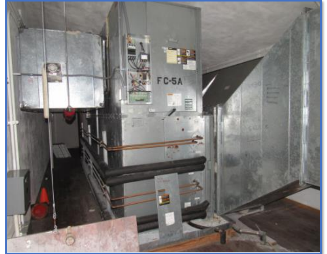
MPR Building – Mezzanine Mechanical Room