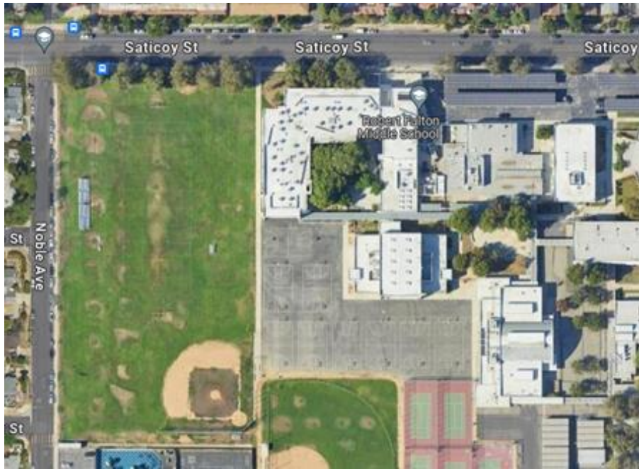
Fulton College Preparatory School