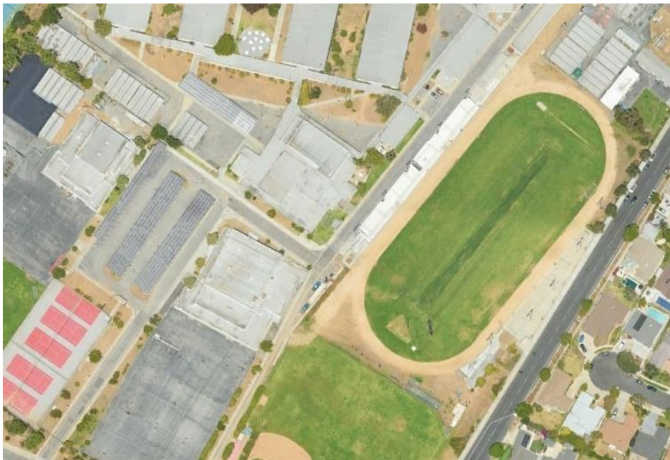
Westchester Enriched Sciences Magnets