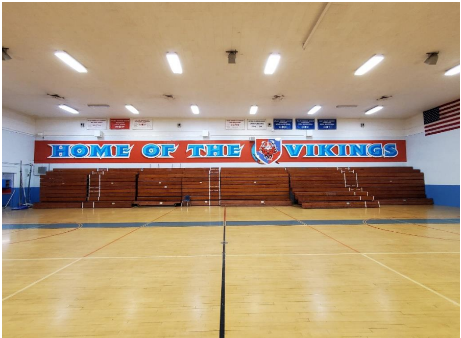
Monroe High School