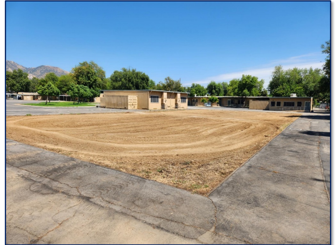
Former area of relocatable buildings