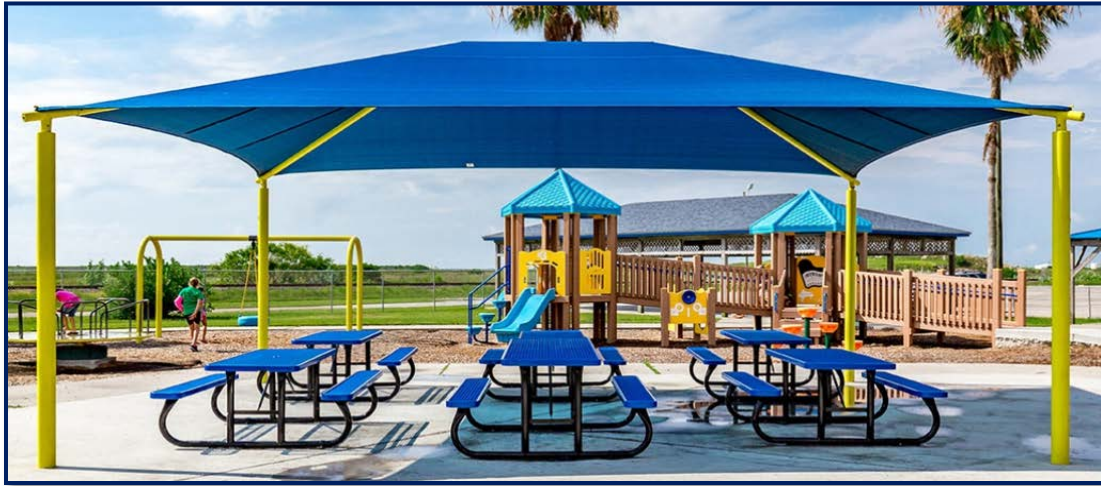
Example of Structure