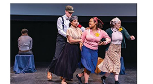
A play that is currently being staged in schools and theaters throughout the US provides an innovative and inclusive approach to teaching the Holocaust.