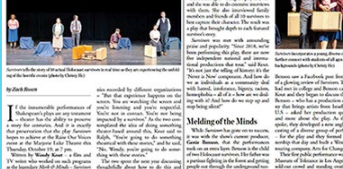
A play that is currently being staged in schools and theaters throughout the US provides an innovative and inclusive approach to teaching the Holocaust.