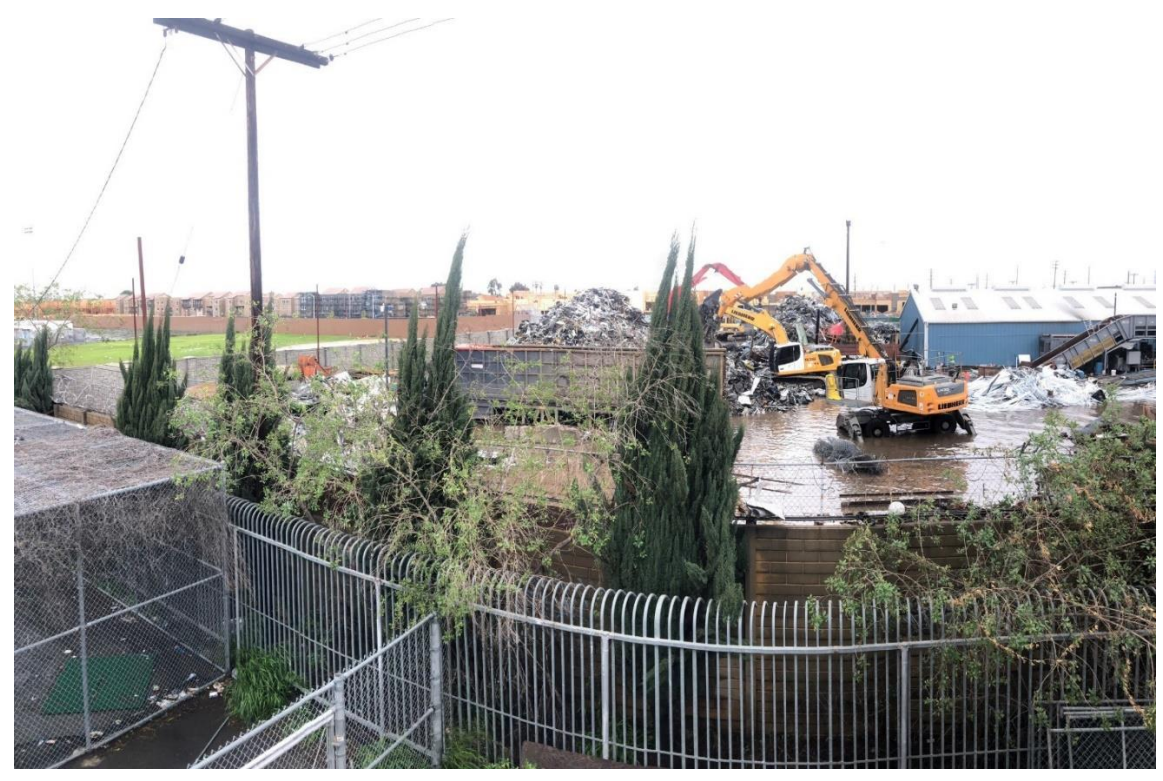
16. All portions of outside storage areas are required to provide adequate grading and drainage and shall be continuously maintained,