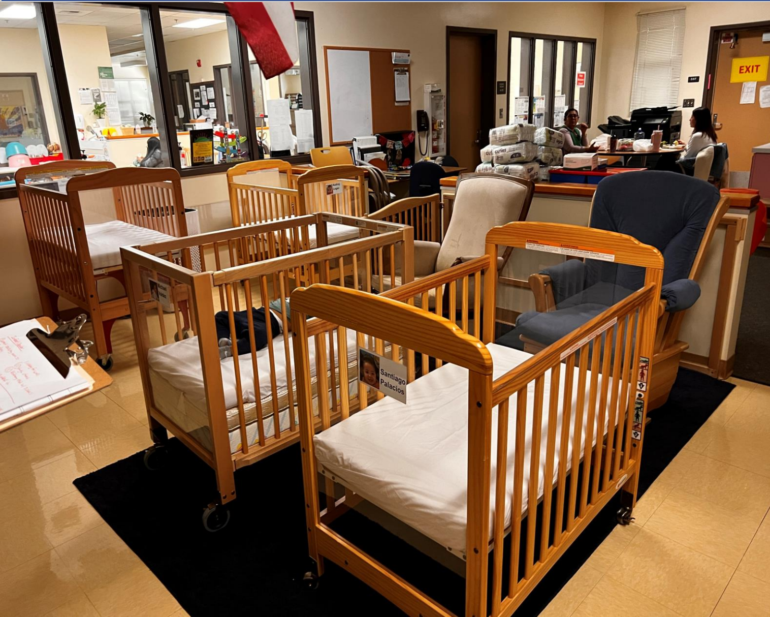
Ramona Infant Center