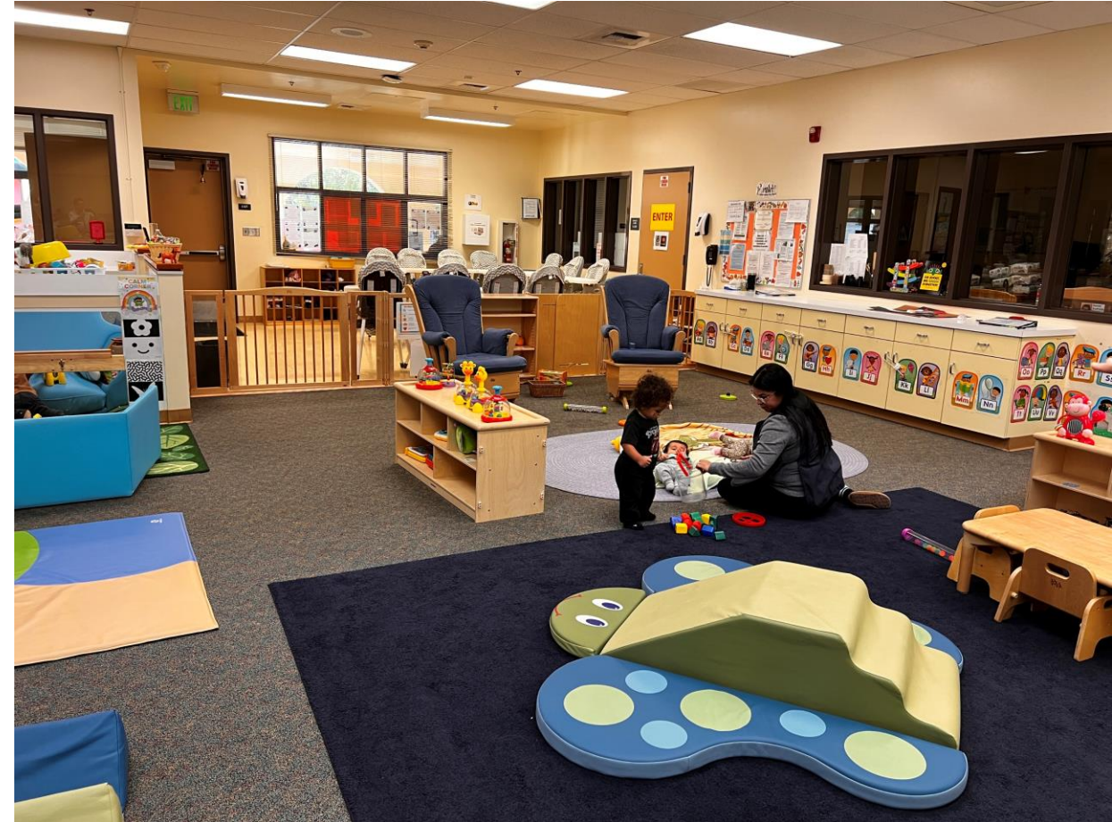
Ramona Infant Center