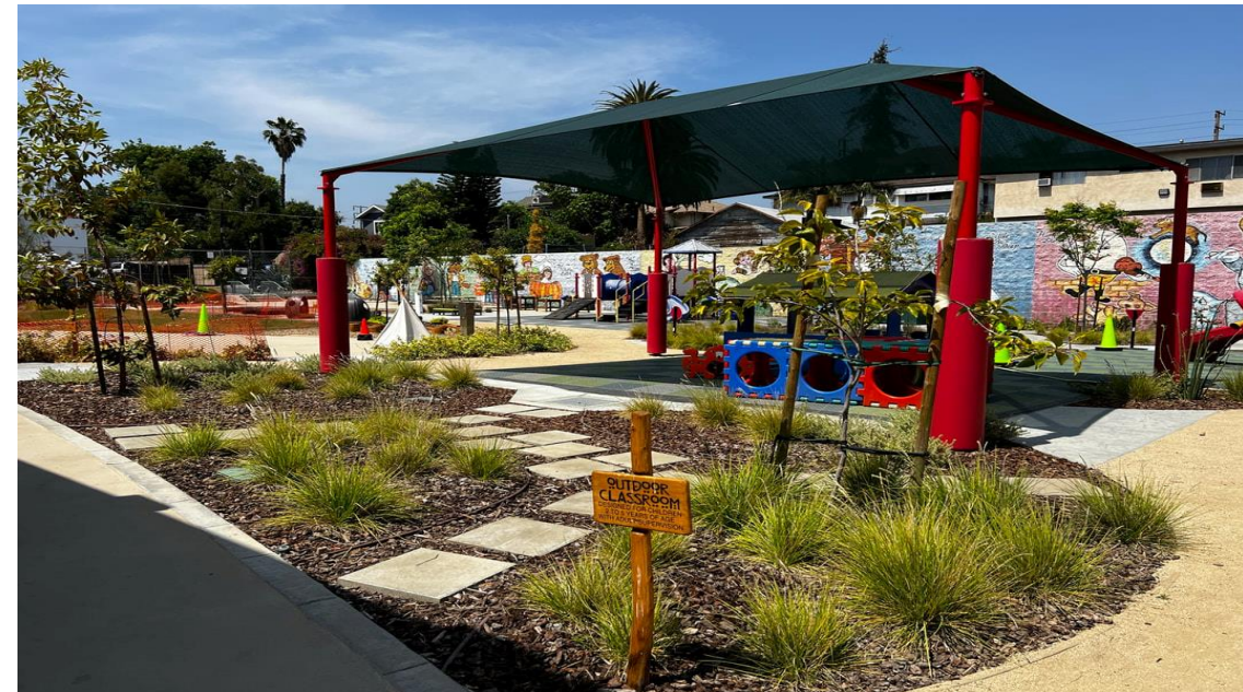
Monte Vista EEC